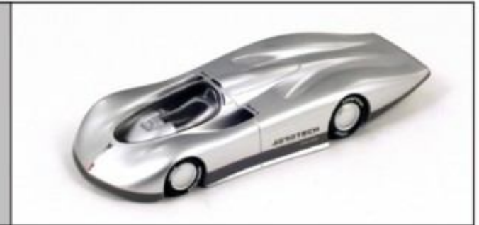
Oldsmobile Aerotech Long Tail