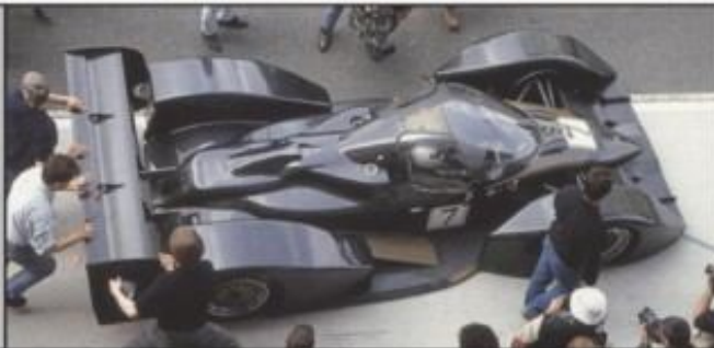
Allard J2X Prototype 1993