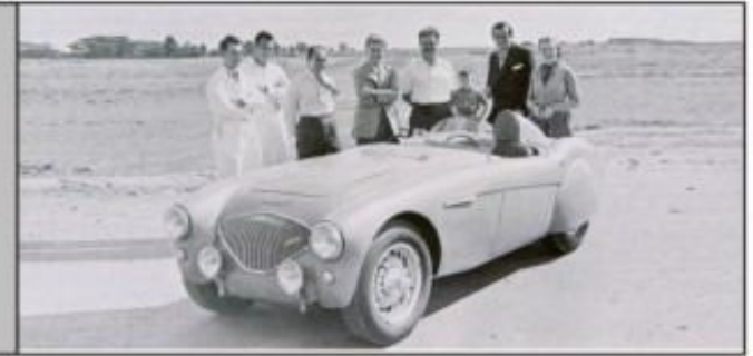
Austin Healey Record Car 1953