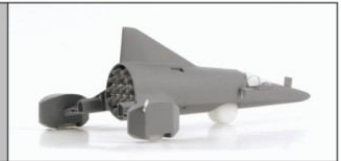
Wingfoot Express Bonneville Bob Tatroe LSR Attempt 1965