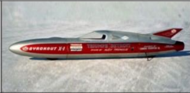
Triumph Gyronaut X1 Bonneville Alex Tremulis LSR 245.667 mph 1965