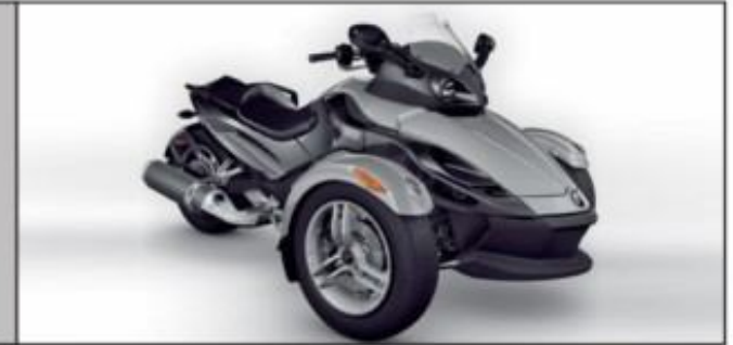
Can Am SPYder 2012