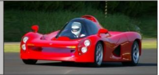
Yamaha OX99 1992