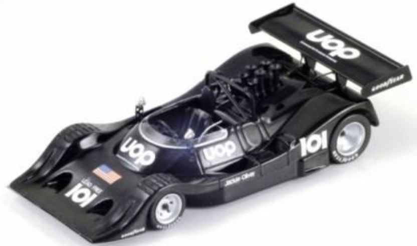
18B002 = Shadow DN4, No.101, Champion Can-Am 1974, Oliver