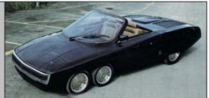
Panther 6 1977