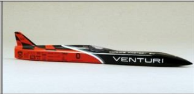
Venturi VBB3 : 303 MPH - 487 KM/H (2009); 307 MPH - 495 KM/H (2010)