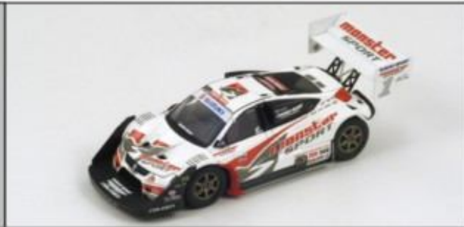
Suzuki SX4, Winner pikes peak 2010 Nobuhiro Tajima