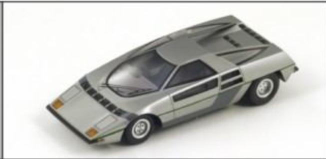
Dome Zero P2 1979