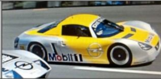
Opel Eco Speedster 2003