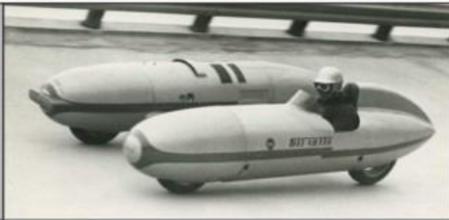
Tarf 1 Gilera Monza Pierro Tarruffi 1956