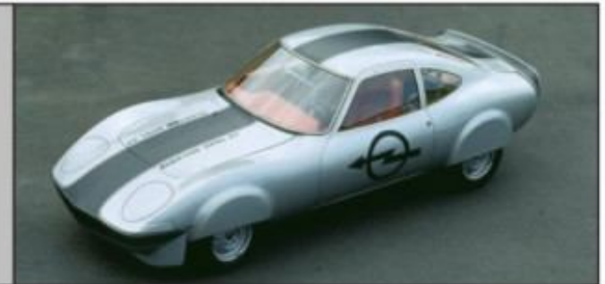
Opel Electro GT 1973