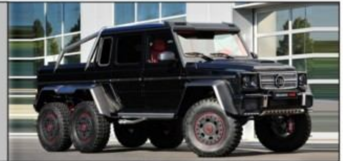
Brabus B63S-700 6x6