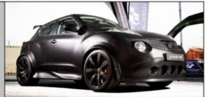
Nissan Juke-R 2012