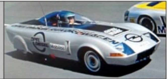
Opel GT Record Car 1972