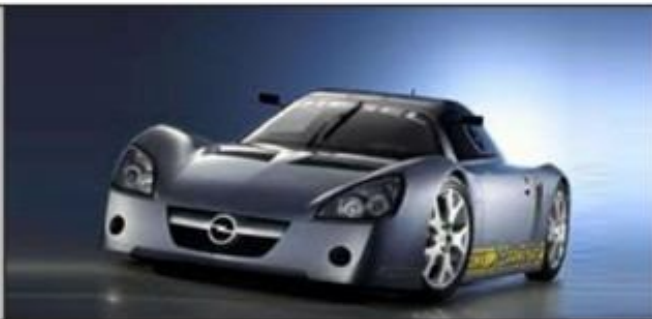
Opel Eco Speedster Paris Auto Show 2002