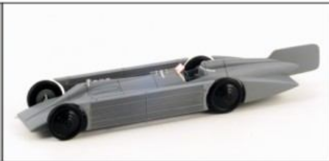
Golden Arrow Daytona Beach Henry Segrave LSR 231.44 mph 1929