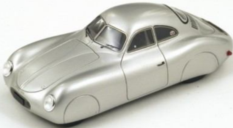
18B003 = VW Porsche Type 64 1939