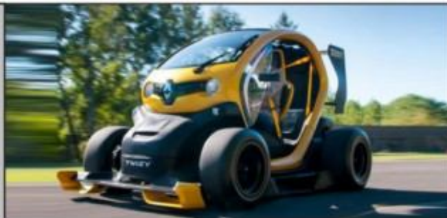
Twizy Renault Sport